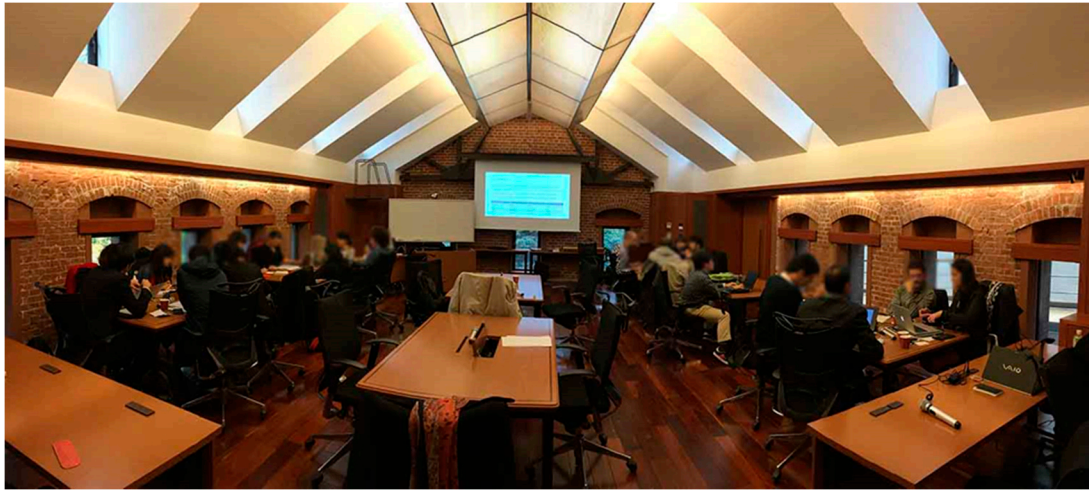
Figure 2. Participants completing the third step of the exercise.

When the second step was complete, participants returned to their original tables to elaborate on the responses they had collected (Step 3, Figure 2). Here, they were also asked to add their own input, synthesize the discussions, and reach consensus on a list of themes related to their assigned questions. The final step (Step 4) involved a plenary session, wherein participants reported back the results of their discussions to all participants and received feedback from the audience.